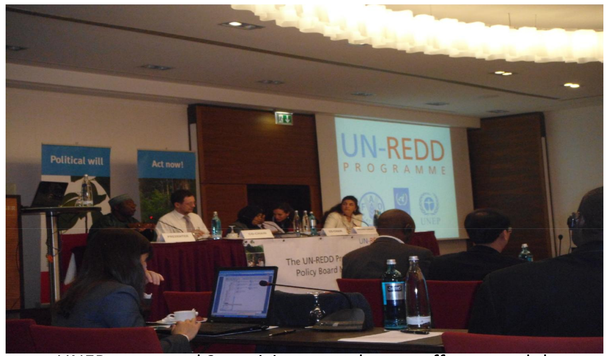
UNEP supported 2 participants and one staff to attend the Seventh UN-REDD Policy Board in Berlin, October 2011